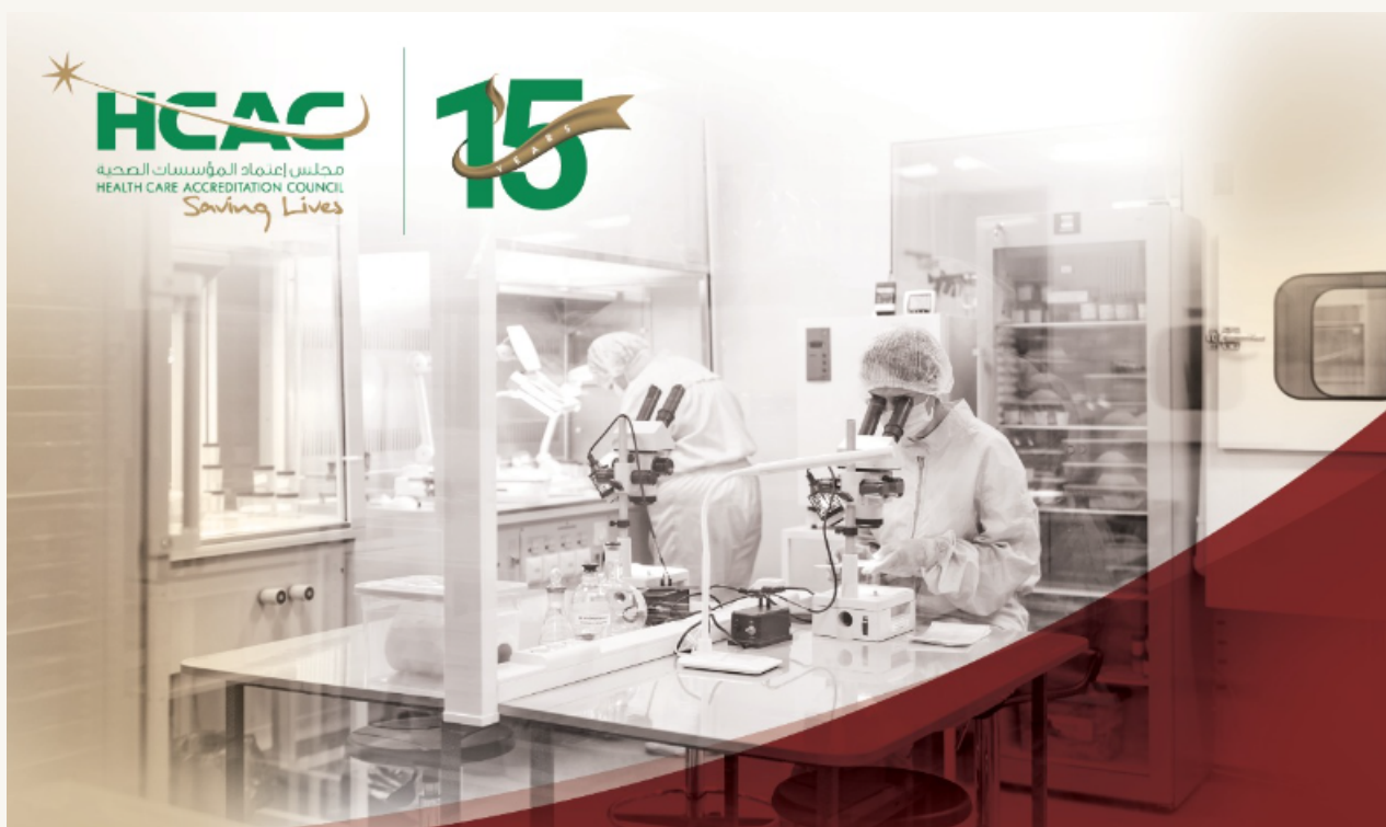
Health Care Accreditation Council (HCAC).