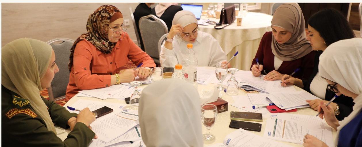
Health Care Accreditation Council (HCAC).