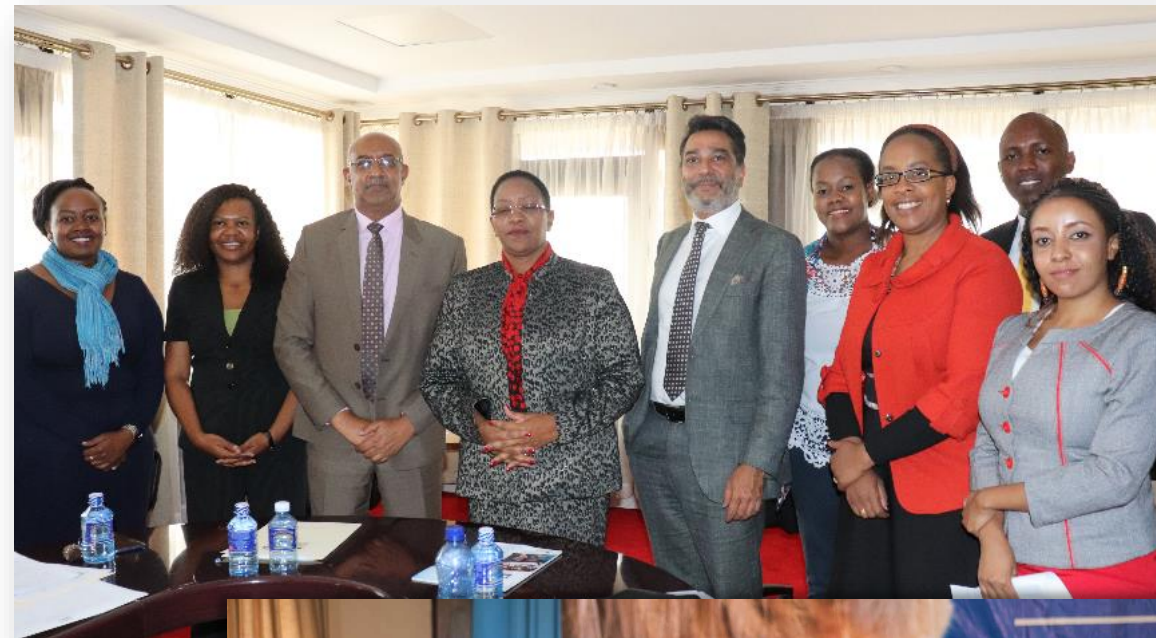
Top: Cabinet Secretary and KHF Leadership Team on August 2019 Right: PRT in progress with the KHF and KEPSA leadership

KHF directly works with the Ministry of Health through Ministerial Stakeholder Forums (MSFs) , with 12 held so far, and the next scheduled for 4 th September 2020. These MSFs provide insights for the Presidential Roundtable (PRT)